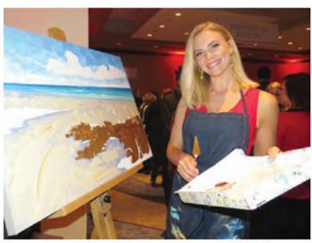
Art work auctioned off later when it was completed