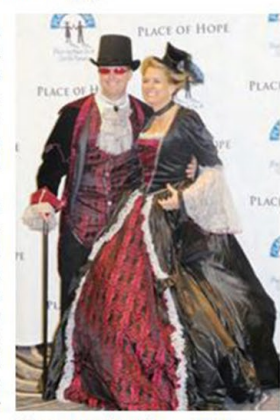
Some came in unique costumes.

Place of Hope is a unique faithbased, state-licensed children's organization providing family-style foster care (emergency and long-term); family outreach and intervention; maternity care; and safety for victims.