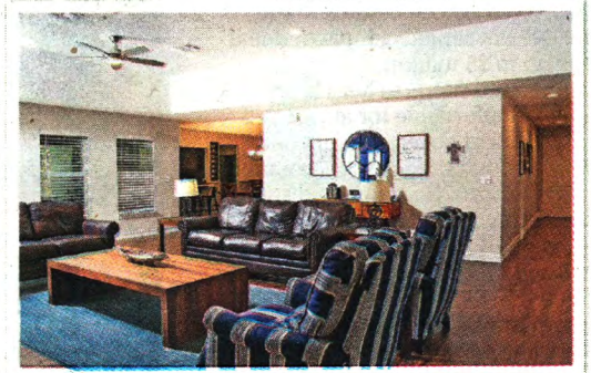
Living room in one of the Paxson Campus cottages.