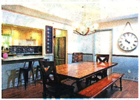
This particular cottage houses six boys, ranging from 5-17 years-old, as well as two parents.