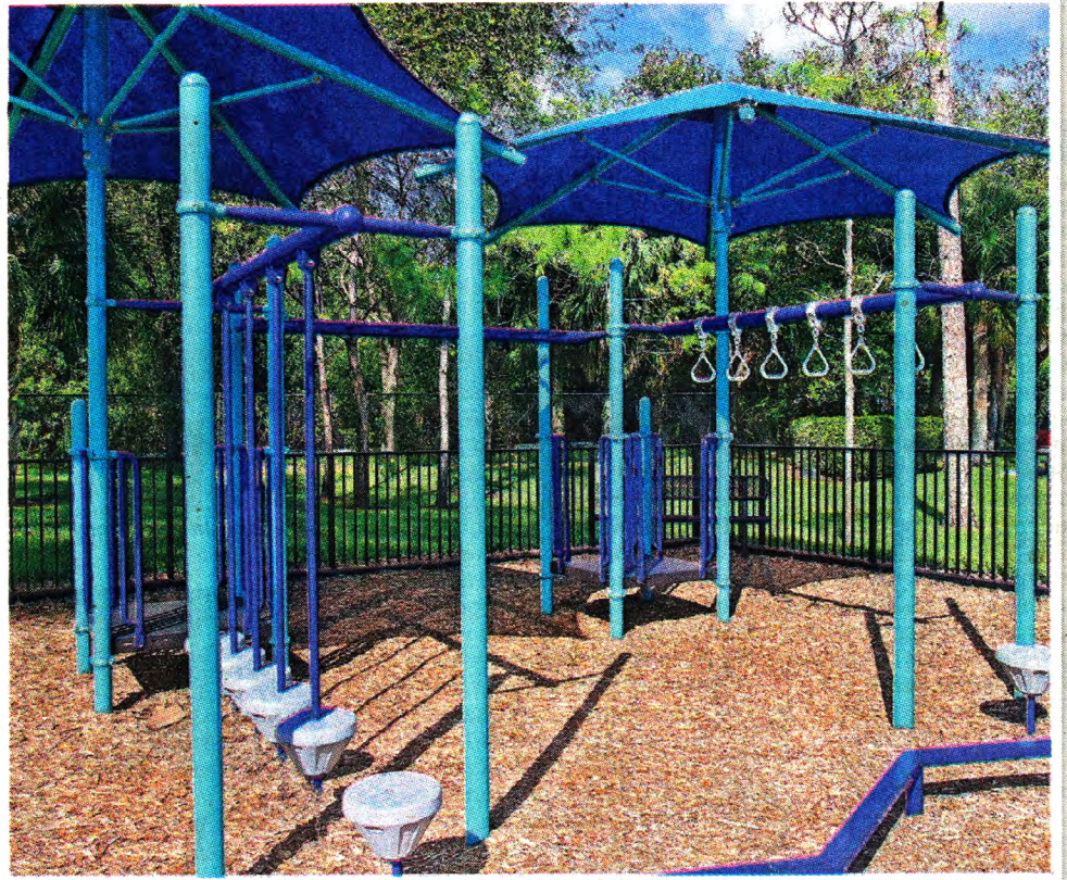
Young residents at the Paxson Campus have access to the GL Homes Playground.

The Lane Outreach Center will be an 18,000-square-foot commercial office center comprising two single-story buildings on Northlake Boulevard in Palm Beach Gardens. Half of this space will be dedicated for Place of Hope's needs and the other half will be contracted long-term to committed tenants.